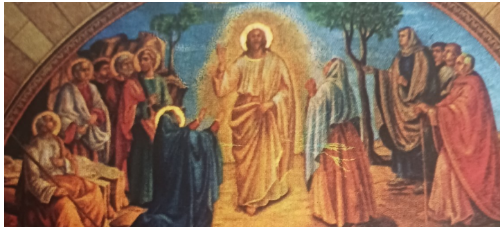
"The words I have spoken to you are Spirit and life." — John 6:60-69